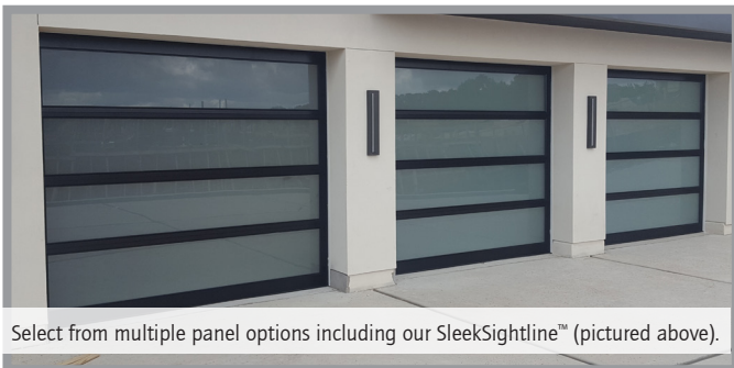
Select from multiple panel options including our SleekSightline™ (pictured above).

Panels: Solid aluminum panels are ideal for busy environments, prevents glass breakage at critical heights, protecting your investment. Insulated panels, kick panels and impact rated panels are also available.