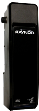
Prodigy II™ with WiFi™ 8500WRGD DC Motor Jackshaft Operation, with WiFi.