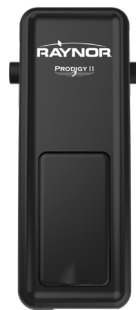
Prodigy II™ 8500RGD DC Motor Jackshaft Operation, maximizes your space.