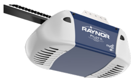
Pilot II™ with WiFi™ 8365WRGD-267 ½ HP Chain Drive with WiFi, smooth, effortless operation.