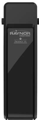
Prodigy III™ 98022RGD DC battery backup WiFi jackshaft