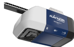
Sergeant II™ with WiFi 8160WBRGDMC ½ HP DC battery backup chain- drive, trusted reliability and quiet operation.