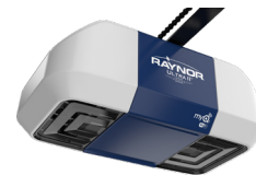
Ultra II™ with WiFi™ 85870WRGD ¾ HP chain-drive, with WiFi, when you need maximum performance.