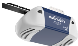
Pilot II™ with WiFi™ 83650RGD-267 ½ HP chain-drive with WiFi, smooth, effortless operation.