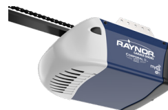
Corporal II™ with WiFi 81650RGD ½ HP chain-drive, lasting performance and dependable operation.